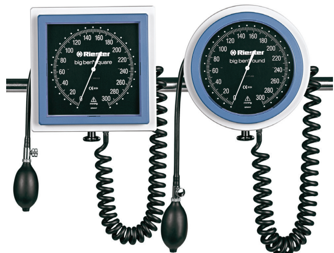
big ben® rail model

Chromium-plated tube screw connection to allow quick changing of cuffs.