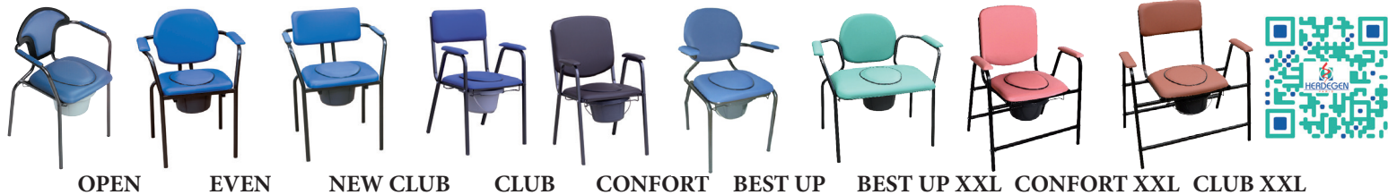
OPEN EVEN NEW CLUB CLUB CONFORT BEST UP BEST UP XXL CONFORT XXL CLUB XXL